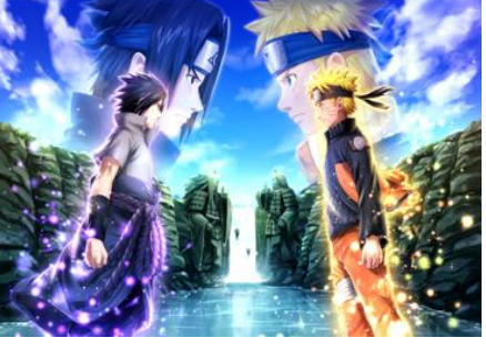
The Final Battle... https://data.naruto-official.com/coloring/naruto_C.png

2)Download the line drawing data from the link below.