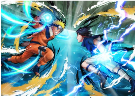
For a Friend! https://data.naruto-official.com/coloring/naruto_D.png

3) During the Campaign period, please post (formerly tweet) your colored data with the hashtag #NINJAVOLTAGEColoringContest